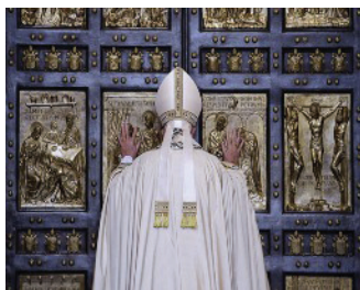
Pope Francis opens the Holy Door to mark opening of the Catholic Holy Year of Mercy Jubilee.

Unfortunately, due to unforeseen circumstances, the St. John's Catholic Community Family Social set for next Sunday, June 19 at Grass Creek has been cancelled.